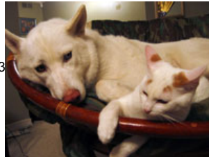
Nico and Peewee